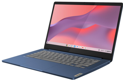
Powered by MediaTek Kompanio