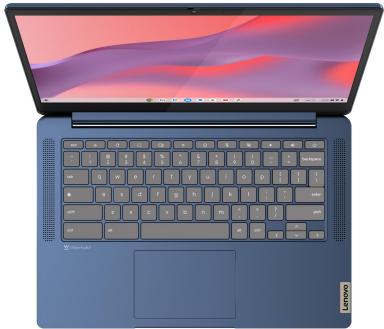
Powered by MediaTek Kompanio